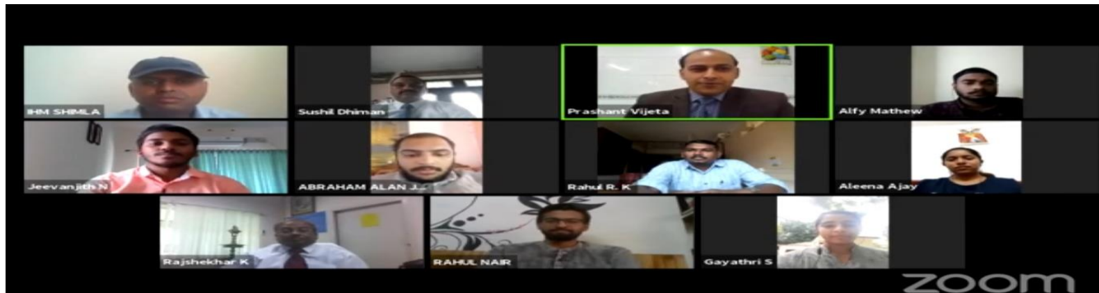
1.IHMCT THIRUVANANTHAPURAM FACULTY & STUDENTS ATTENDING THE LIVE DEMO COOKING OF IHM SHIMLA STUDENT - 3 RD JUNE 2020